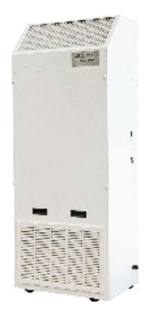
IsoClean 800 air cleaning recirculation setup

Portable, self-contained High Efficiency Particulate Air (HEPA) filtration system with optional UV-C light.